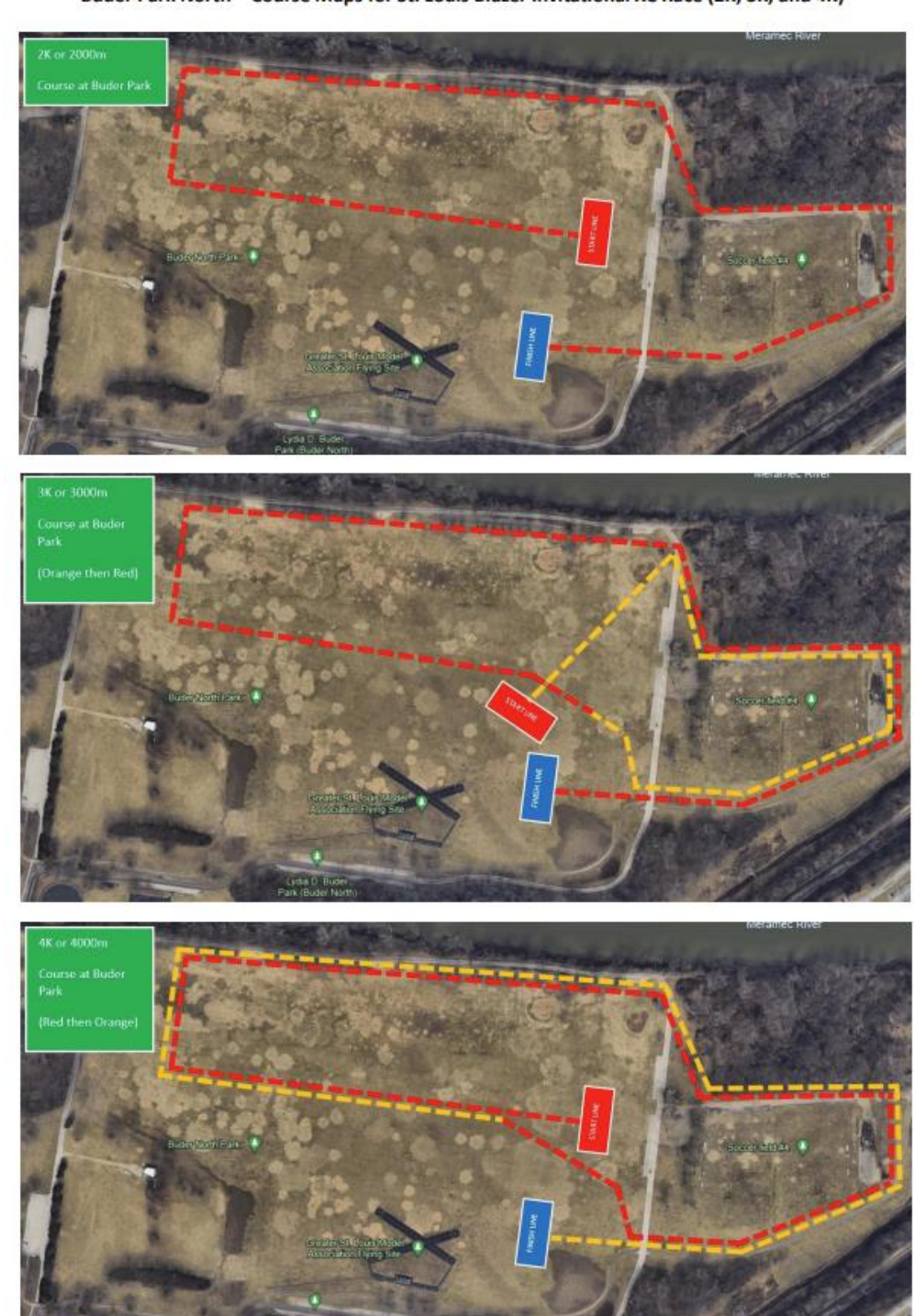
Buder Park North - Course Maps for St. Louis Blazer Invitational XC Race (2K, 3K, and 4K)

Course: Single-lined with additional loop depending on race distance, marked with flags. Fast and flat. Course will be painted Saturday morning and available for course inspection that afternoon. Course walk-through's are welcome on Saturday afternoon and Sunday morning before the first race at 9:00am.